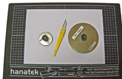
Sample template cutter for 50mm and 115mm \varnothing included with instrument. Suitable for low volume testing.